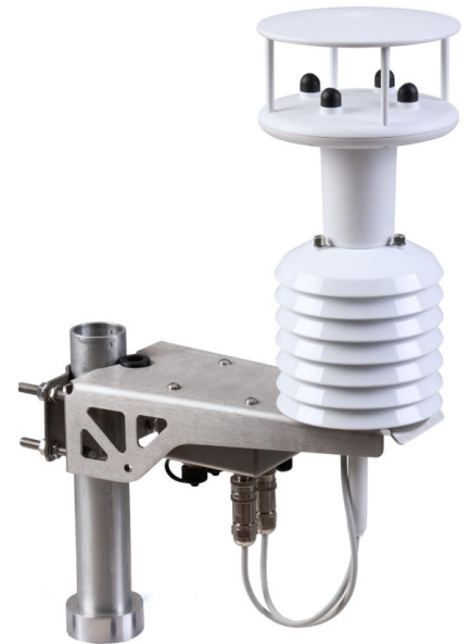
MetConnect One compact model with integrated wind sensor